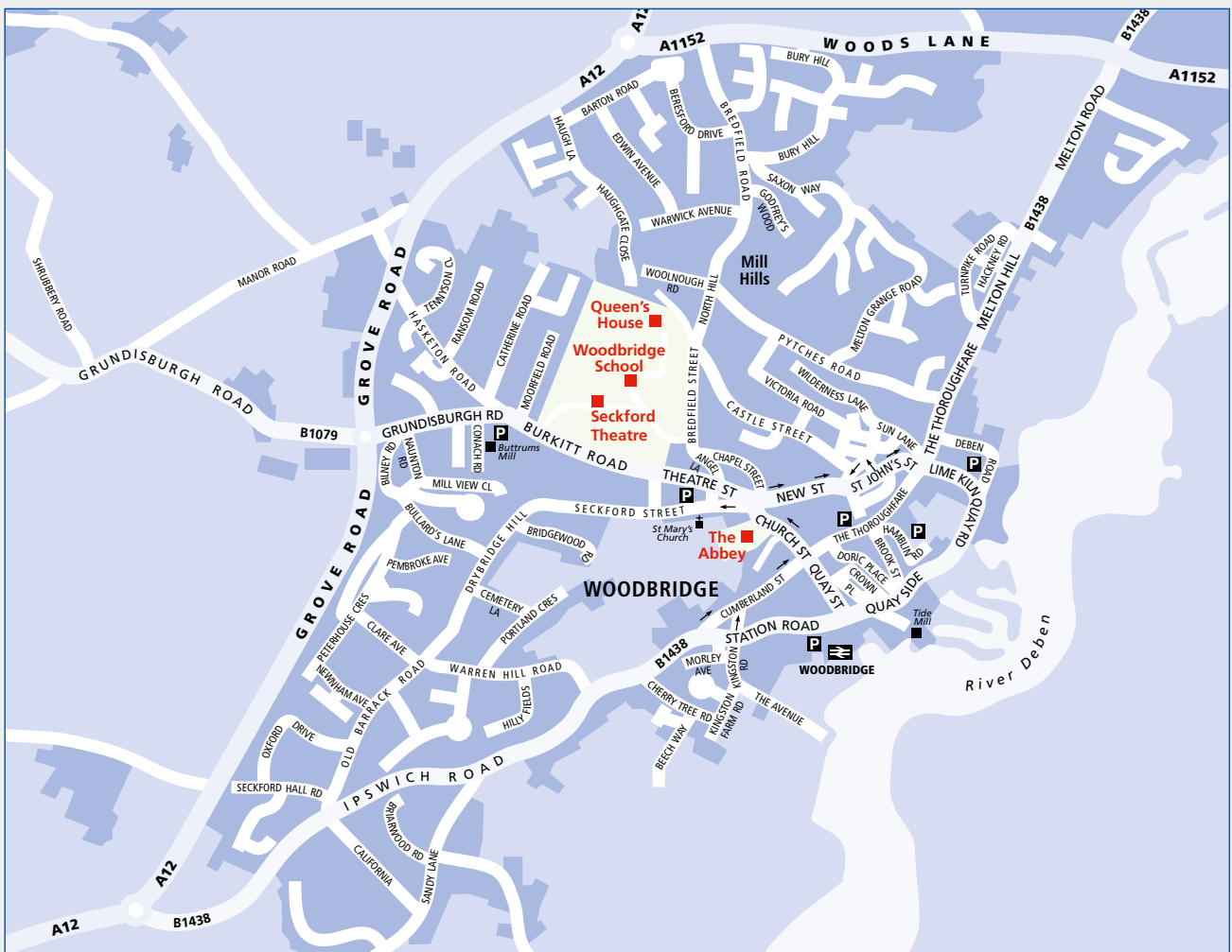
Licence Number PU100029016